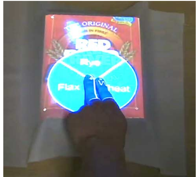
Figure 1. Cloth draped over a cereal box provides an interactive menu to its ingredients in a language of choice.

Copyright 2011 ACM 978-1-4503-0478-8/11/01...$10.00.