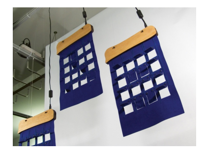
figure 4. Shape changing textile surface for environmental control and communication [1].

resolution, full-color, interactive graphics? There are few early projects that explored these possibilities [5] suggesting that the design of interface elements and mappings should follow the 3D physical shape of the display itself: form of the display equals its function .