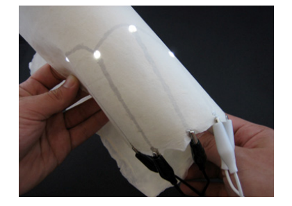
figure 2. Composite combining natural paper and electronic components [2].