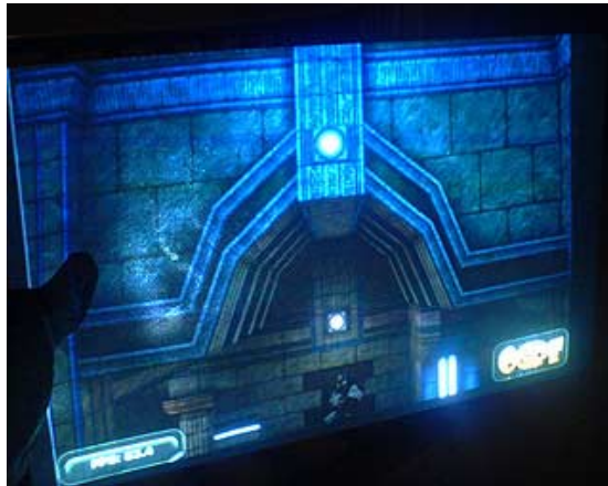
Figure 5. Sample game projected on Cobra board.

Because the projected image is transformed to follow and fit the board, objects and people in the user's vicinity are not affected by the projection. This makes Cobra private and non-invasive, unlike other projection-based interfaces, such as Wear Ur World / Sixth Sense [7]. When the user lowers the board or moves it out of the way, it leaves the projector's light cone, and the entire projected image disappears, thus saving battery power. When the player wants to stop playing, he or she simply puts the board back into the bag.