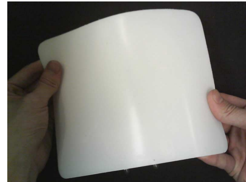
Figure 2. The front side of the Cobra board.

The other half of the hardware consists of a pocket projector and a disassembled Wii Remote, joined together, and attached to the bag's shoulder strap. These are adjusted to rest on top of the shoulder and point roughly towards where the board will be held. The projector cable runs under the bag's strap, and into the bag. The Wii Remote tracks the infrared LEDs on the board, and wirelessly communicates this data to the computer, which then uses this data to determine the board's position and orientation relative to the player. The screen area of the game being played is transformed based on this data, and the projector projects this transformed image onto the board. Like PaperWindows [2], Cobra uses a combination of computer vision and projection for tracking and display. This frees the board from having to have its own display, and allows it to be wireless. Unlike PaperWindows, however, Cobra does not use machine vision to detect bending. Instead, Cobra uses embedded sensors like Gummi [3], providing reliable and responsive input.