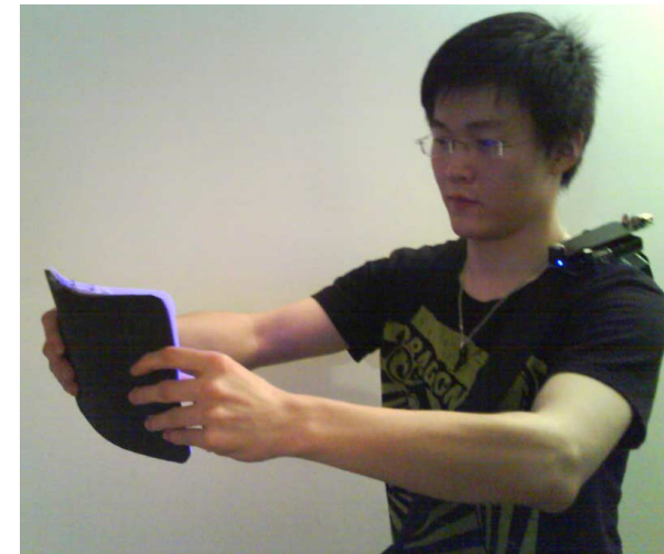
Figure 4. A Cobra player in action.

Since most notebook users carry their computers around in a bag anyway, the only extra load Cobra requires is the board and the shoulder-mounted projection unit. When not in use, the board fits nicely in the bag with the computer. While playing, the user is free to move around in the real world. The tracker only acquires the board's position and orientation relative to the user, so the user's actual position and orientation in the real world do not affect the game.